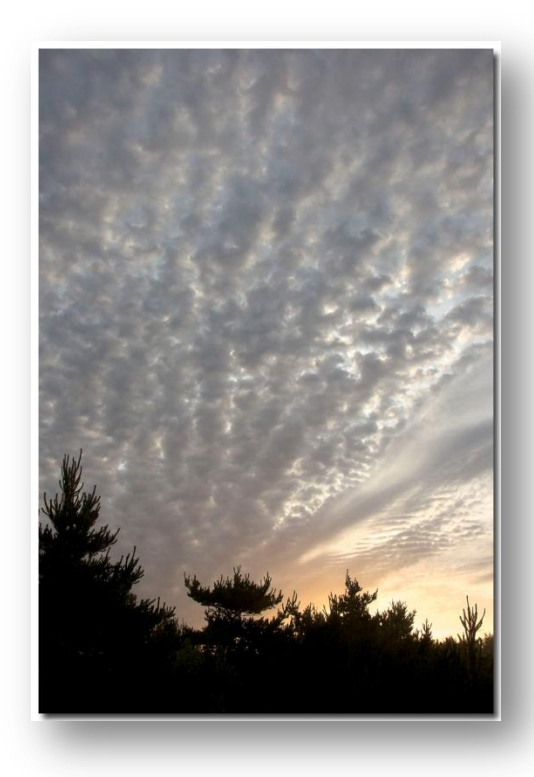
Gold Beach Sunset – Mike Schumacher

Sierra Trading Post <u>www.sierratradingpost.com</u> (closeouts and seconds) Top quality stuff with cosmetic blemishes mixed in with fashion items. If they have your size, prices are great. Retail Store in Reno.