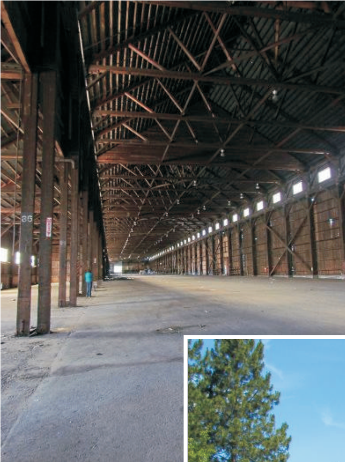
Old mill, main building