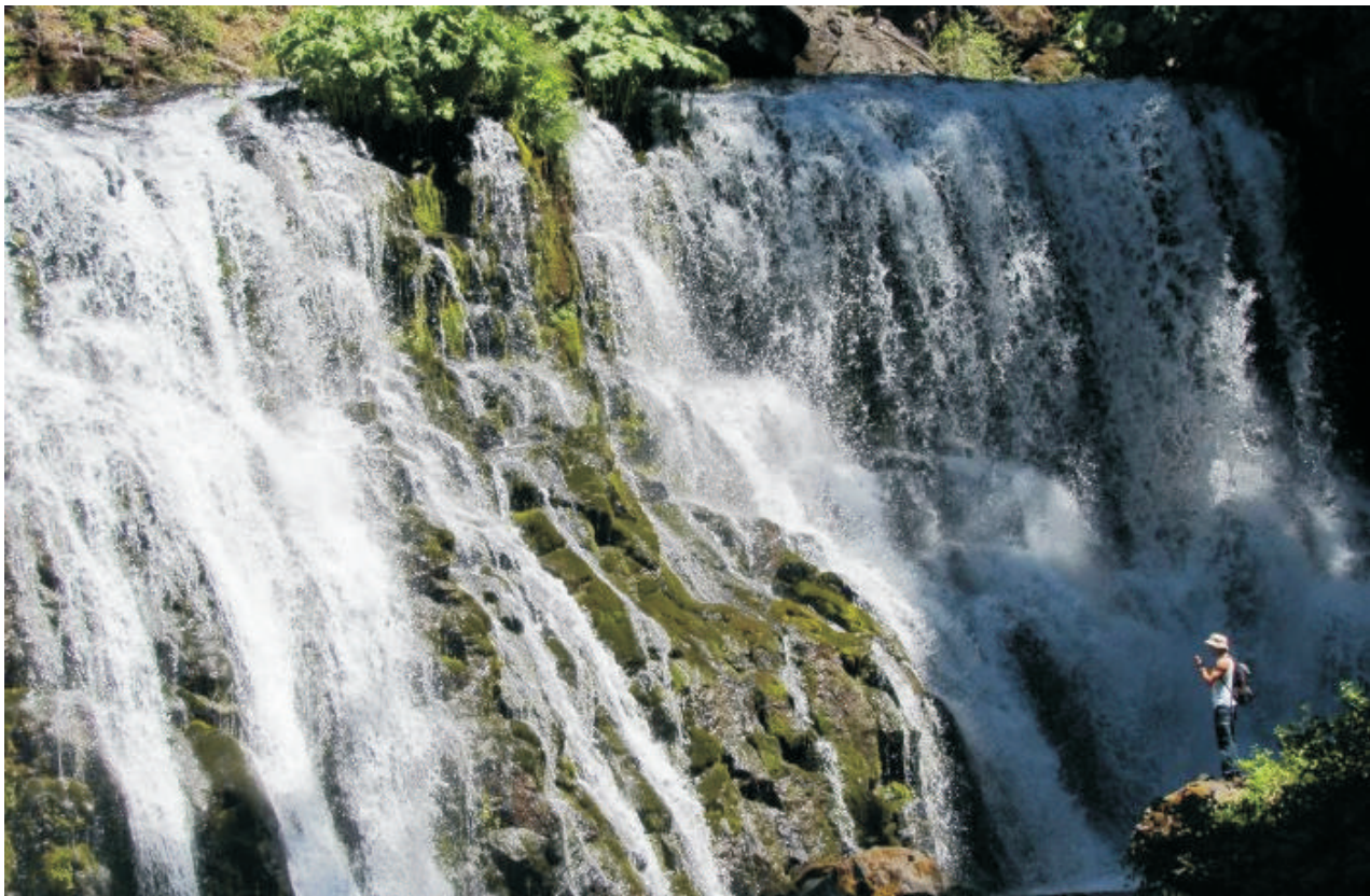
Bottom of middle falls, McCloud River