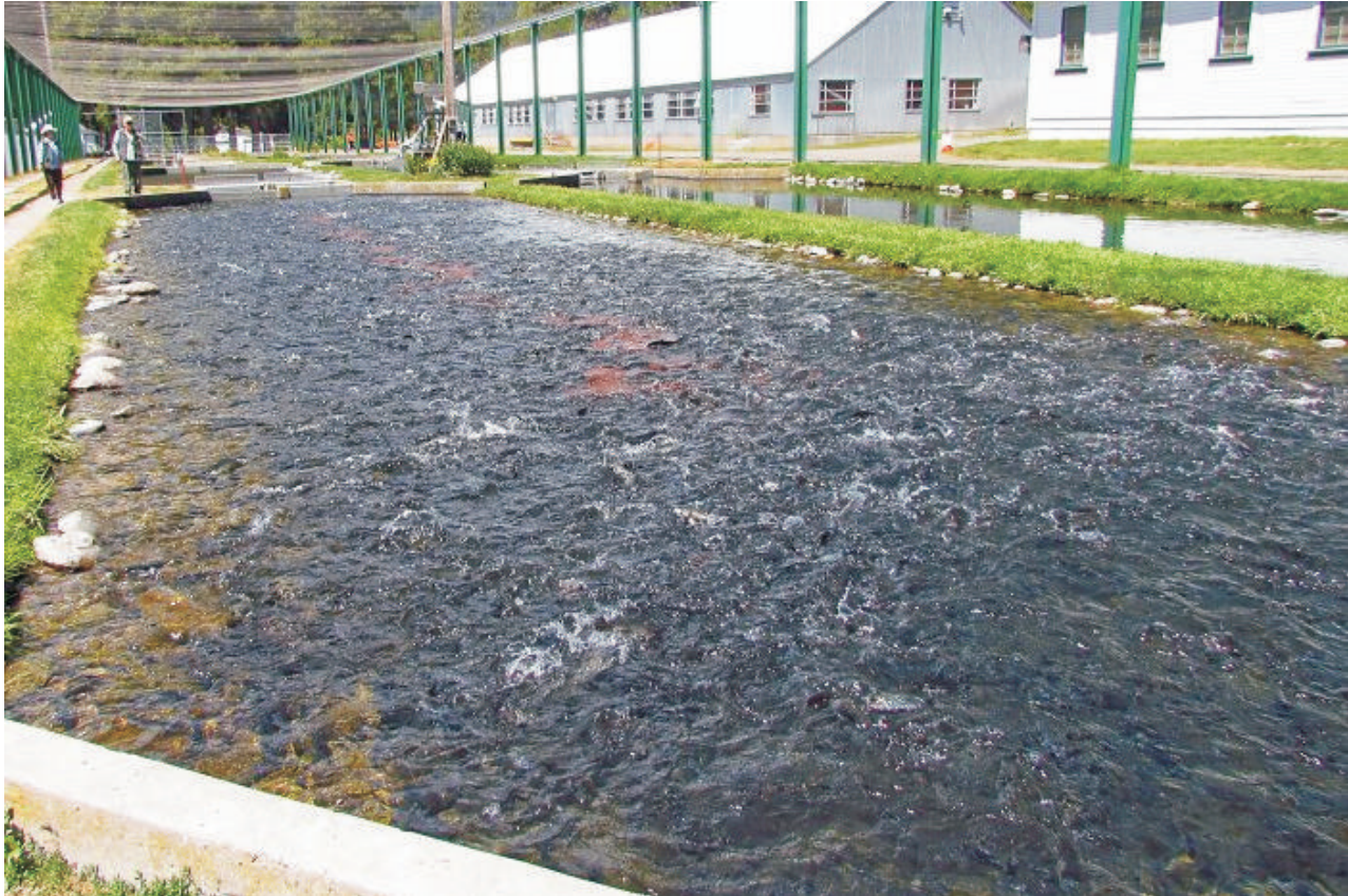
Feeding time at the hatchery