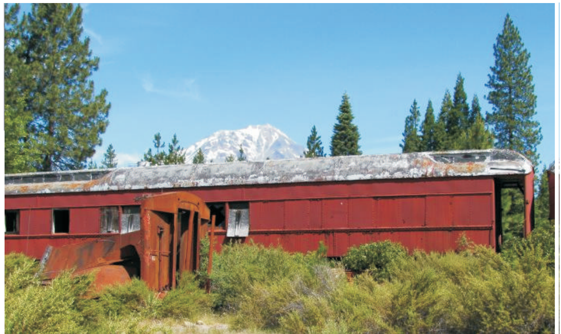
Mt. Shasta and old car