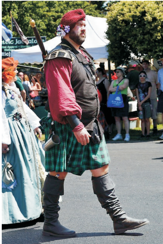
I call this shot "Fee-Fie-Fo-Fum!" This Scot was over 6'8"! A real Scottish Giant!