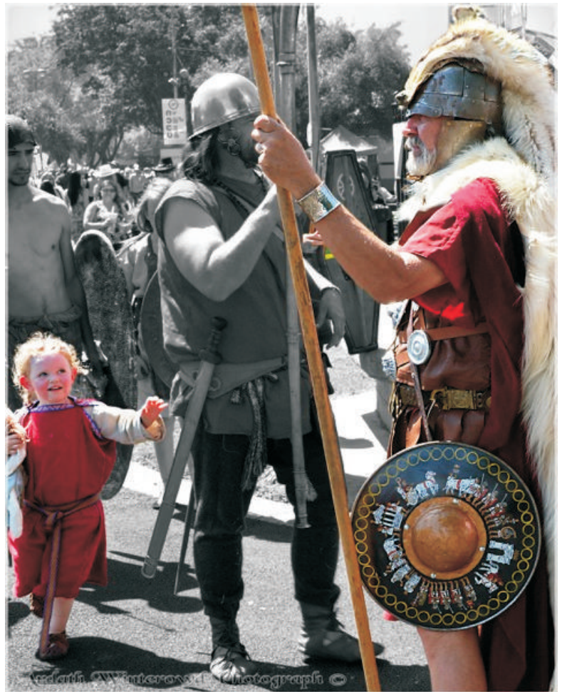
© Face To Face • Ardath Winterowd