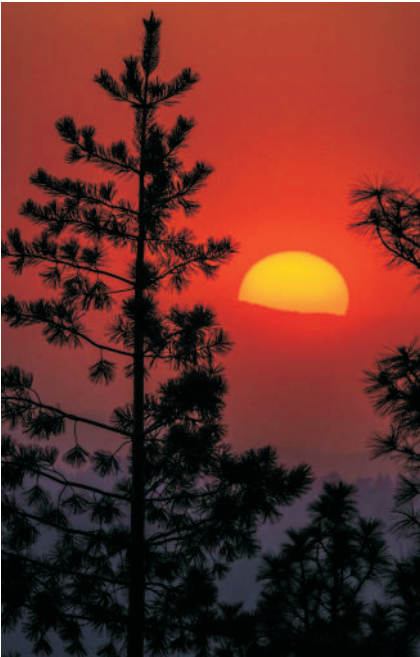
Smokey Sunset Single Image