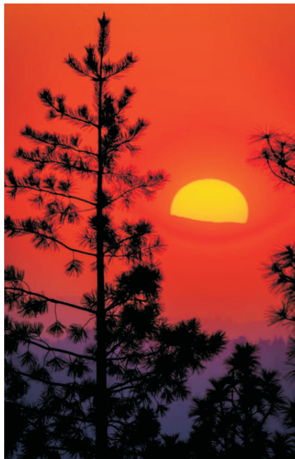
Smokey Sunset HDR