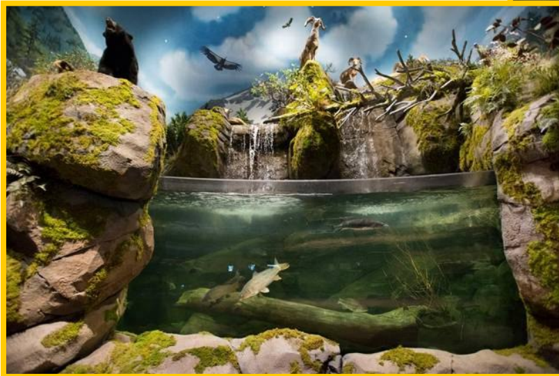
Filler Photo from the Internet..