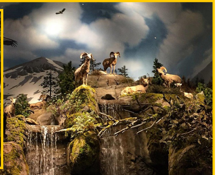
Big horn sheep.