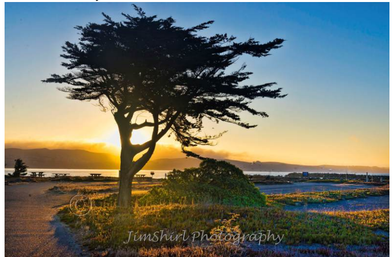
Doran Beach Campground