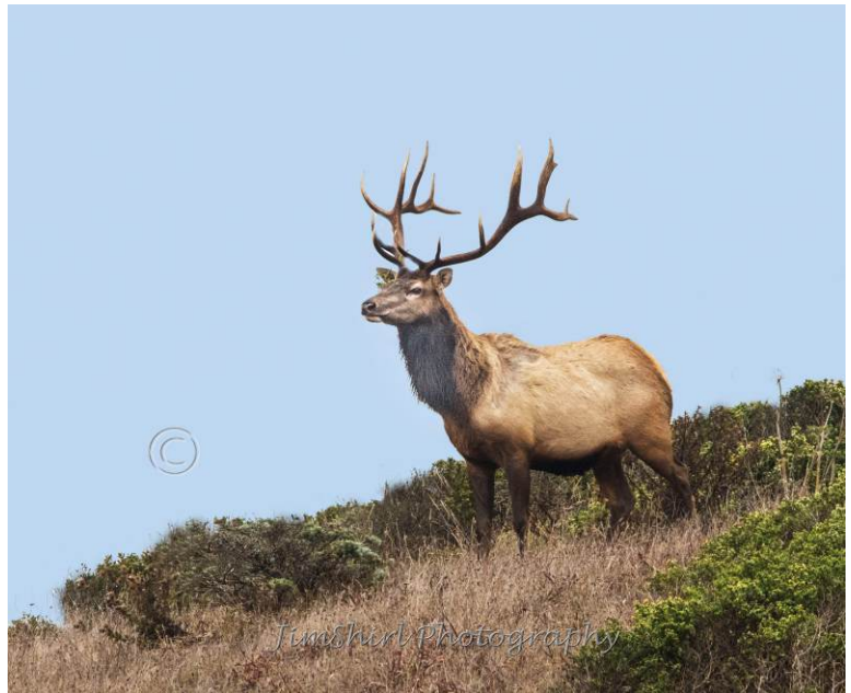
Elk at Point Reyes National Seashore

We photographed for three days at Pt. Reyes National Seashore where we photographed Bobcats, Elk, Coyotes, Hawks, Elephant Seals, Quail, and sea birds. We camped two more days at the Doran Beach Campgrounds at Bodega Bay where we shot hundreds of Shorebirds, many I did not know or had not seen before. If you have not been to these two wonderful places you should go this fall, during periods of no storms when the Elk are in rut and the millions of ocean birds come down the coast to spend the winter in wonderful Sonoma County. I recommend the fish Cioppino at the Tides restaurant in Bodega Bay. You will not find a better one anywhere.