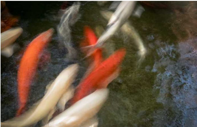
Koi Slow Shutter Speed 0.4 sec