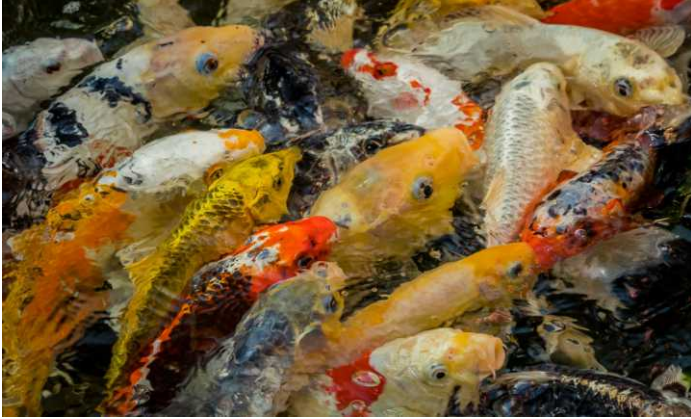
Koi 14 of 15's a Crowd

Looking for something to shoot between summer & fall color we hit on Koi. Googling the subject showed a lot of Koi pond suppliers & builders. We remembered 2 nurseries with Koi ponds. Lake's Nursery in Newcastle and High Hand Nursery in Loomis. Out of courtesy we checked in with the nurseries when we got there and were welcomed in both instances.