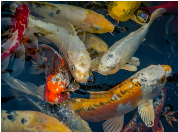
Koi 14 Close Up