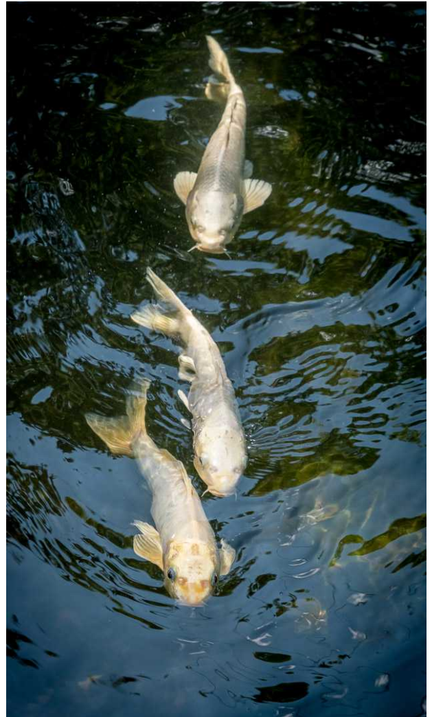
Koi 1 Patterns